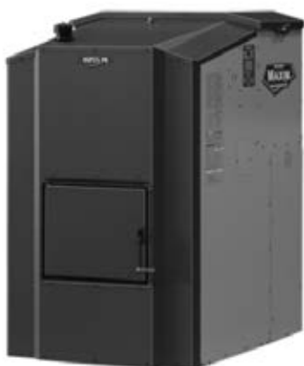
Maxim M255 PE Outdoor Wood Pellet and Corn Furnace