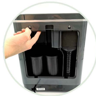
Reset Change Filter Light.