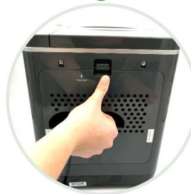
Close back panel.