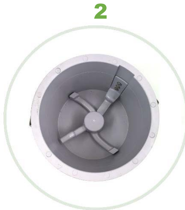
2 Remove all blockages & loose particles from bucket interior.