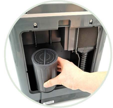
Remove used filters (counterclockwise)