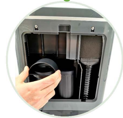
Place filter caps over new filters.