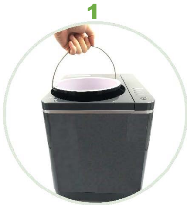
1 Remove bucket.*

Your FoodCycler's grinding bucket is made from tough aluminum and a protective porcelain coating, making your bucket dishwasher friendly for ultimate convenience. Cleaning Your bucket is not necessary for effective processing and is entirely optional.