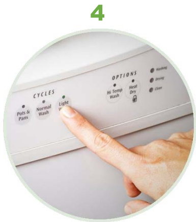
4 Run a hot or normal cycle.