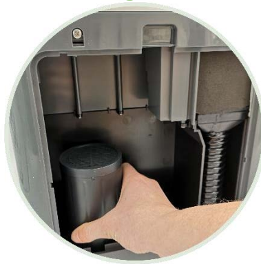
Install new filters (clockwise).