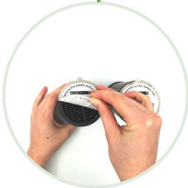
Remove new filter packaging