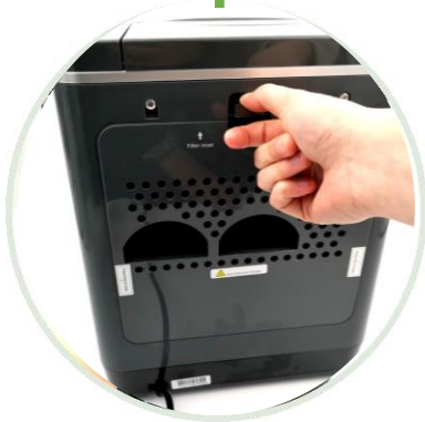
Open back panel.