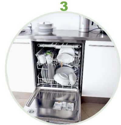
3 Place bucket in lower rack of dishwasher.