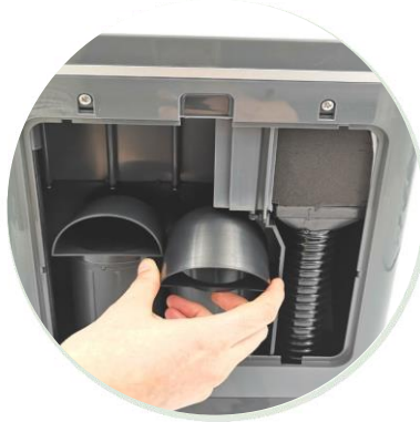
Remove filter caps.